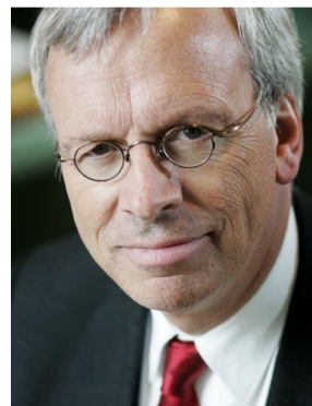
Professor Hans Evers WES President

At least 836 different explanations exist for the way in which minimal endometriosis causes infertility. All cytokines, most steroid and many protein hormones, prostaglandins and leukotrienes, and a host of other soluble substances in the blood, the peritoneal fluid and the follicle have been incriminated, as have macrophages, natural killer cells, B cells, T cells, altered uterine and tubal activity, endometrial wave-like movements, ovum capture disturbances, fimbrial, oocyte and fertilization factors, tubal milieu, endometrium and implantation, and immune processes to name but a few. Not to forget disorders of sperm transport, failed capacitation, disturbed folliculogenesis and/or ovulation, reduced oocyte and/or embryo quality, and of course apoptosis and reactive oxygen species. However, since Ken Muse published his landmark paper "How does mild endometriosis cause infertility?" (Fertility & Sterility 1982; 38:145-52), people have also been wondering about the appropriateness of the "How" in the paper's title: does mild endometriosis really affect fertility at all?