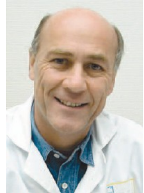
Professor Bernard Hédon

On the one hand, a short interval may not leave enough time to obtain a spontaneous pregnancy, questioning the utility of surgery. On the other hand, a long interval may increase the risk of recurrent endometriosis. It may also worsen the effect of increasing female age and lower ovarian reserve, and thus lower the IVF prognosis. This was borne out in this study with the analysis of results according